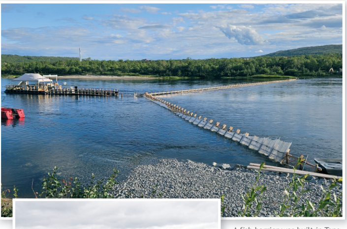
A fish barrier was built in Tana in 2023 to combat pink salmon.

Former Minister of Climate and Environment, Espen Bart Eide, visiting the fish barrier in Tana.