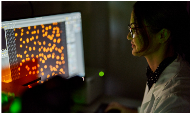
From one of NVI's laboratories at Ås.

The Norwegian Veterinary Institute is actively engaged in research with our 100 ongoing projects funded by both national and international agencies, including various EU programs. These projects lead to numerous scientific publications in respected international journals. The institute also plays an important role in academic development, contributing to PhD education and maintaining strong ties to global research communities.